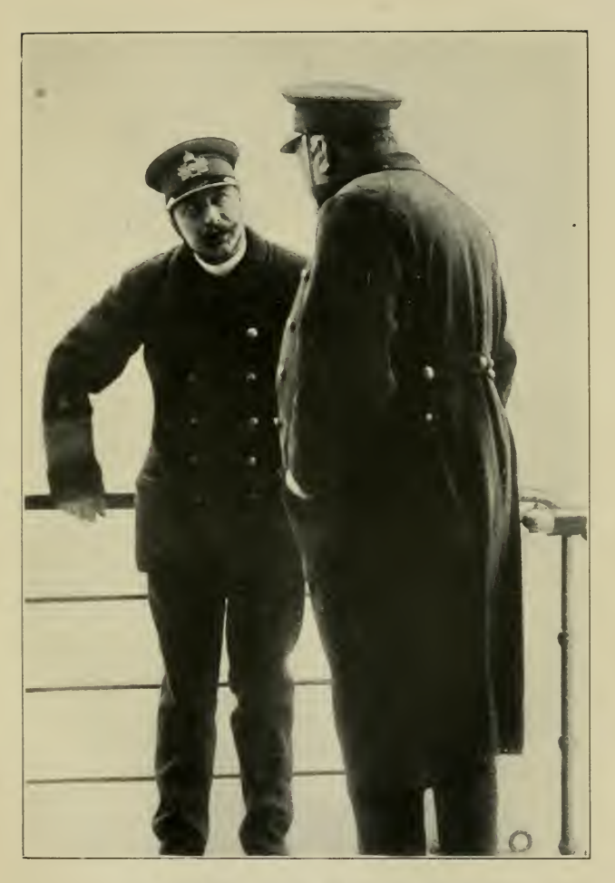
"OUR FUTURE LIES UPON THE WATER" THE EMPEROR ON SHIPBOARD IN THE AUTUMN OF 1898